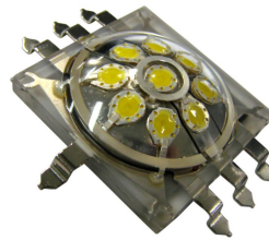
Prototype 3G 9 LED White Matrix (or Turtle as it affectionately known)